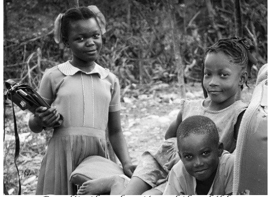
Benefits the education of the children in Boucan-Carre, Haiti.

Peninsula Track Club timed race. No PTC passes accepted at this event.